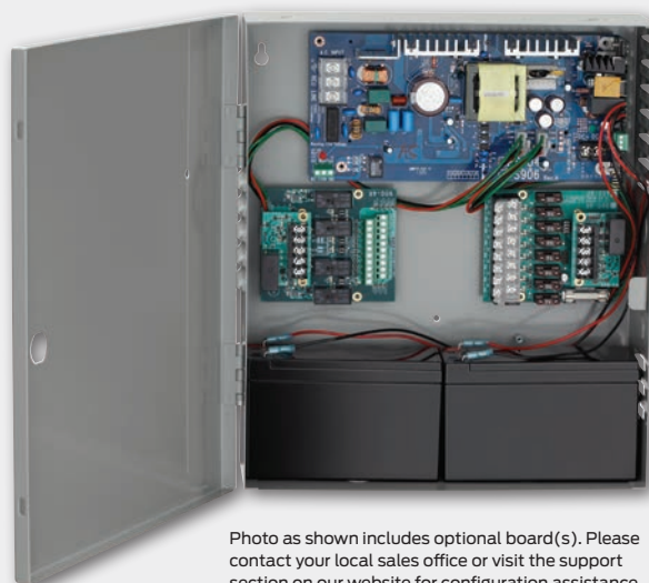
Photo as shown includes optional board(s). Please contact your local sales office or visit the support section on our website for configuration assistance.