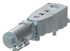
9530-3454 Motor Gearbox