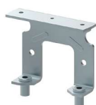
9530-3018 Rear Mounting Bracket