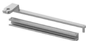
9530-3077PLCM Standard Arm Assembly