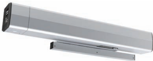
32" length, single unit

Superior door control for rigorous, high-use applications