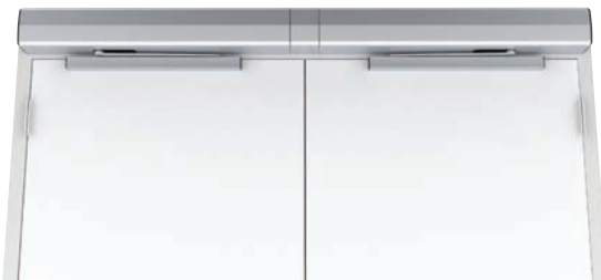
Full-length, modular backplate and cover spans a pair of doors