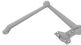
4030-3077SCNS Spring CUSH Arm