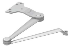
4030-3077EDA Extra Duty Arm