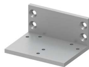
4030-419 PA Flush Panel Adapter