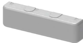
4030-72MC Metal Cover