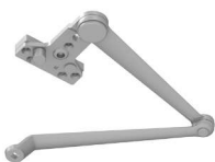
4030-3077CNS Cush-n-Stop® Arm