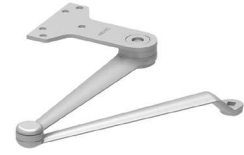
4030-3049EDA Hold-Open EDA Arm