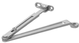
4030-3077 Regular Arm