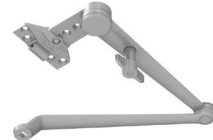
4030-3049SCNS Spring HCUSH Arm