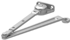
4030-3049 Hold-Open Arm