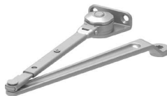
4030-3049L Long Hold-Open Arm