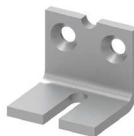
4030-30 CUSH Shoe Support