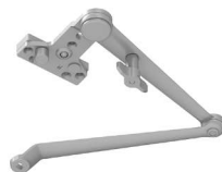
4030-3049CNS Hold-Open CUSH Arm