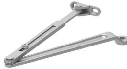
4030-3077L Long Arm