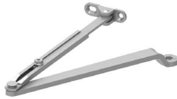
4030-3077LD Light Duty Arm