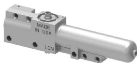
4031-3071 Cast Iron Cylinder Assembly