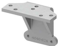
4030-62A Auxiliary Shoe