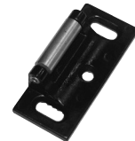
299F 2 7/8" x 1 1/4" x 13/16" (H x W x D)