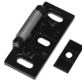
299 7 7/8" x 1 1/4" x 13/16" (H x W x D) Panic device only.