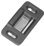
1606 2 7/8" x 1 3/8" x 3/8" (H x W x D) Panic device only.