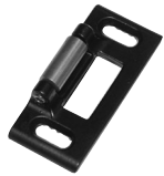
264 2 7/8" x 1 1/4" x 9/16" (H x W x D) Panic device only.