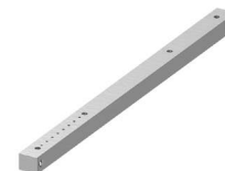
3130-3038HB Hold-Open Track with Bumper