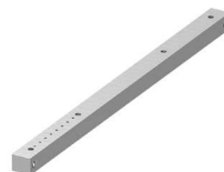
3130-3038H Hold-Open track