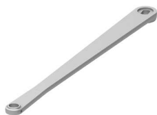
3130-3077T Standard Arm