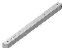
3130-3038B Standard Track with Bumper