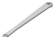
3130SE-3077T Standard Arm