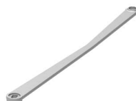
3130SEL-3077T Long Arm