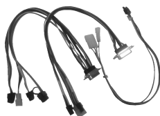
8310-3134 Retrofit Cable Kit