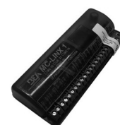
8310-845 Programmable Relay Module