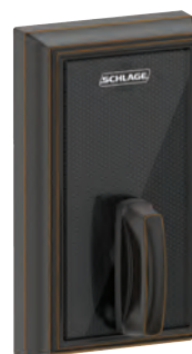
BE467F Schlage Control™ Smart Deadbolt with Addison trim in Aged Bronze