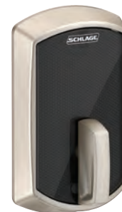
BE467F Schlage Control™ Smart Deadbolt with Greenwich trim in Satin Nickel