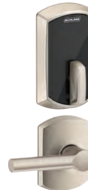
BE467F Schlage Control™ Smart Deadbolt Lock with Greenwich trim in Satin Nickel with Broadway Lever