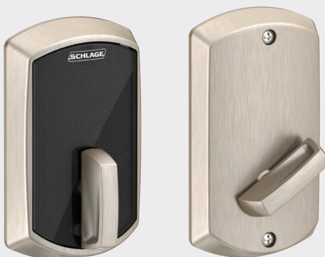
Schlage Control™ Smart Deadbolt with Greenwich trim in Satin Nickel