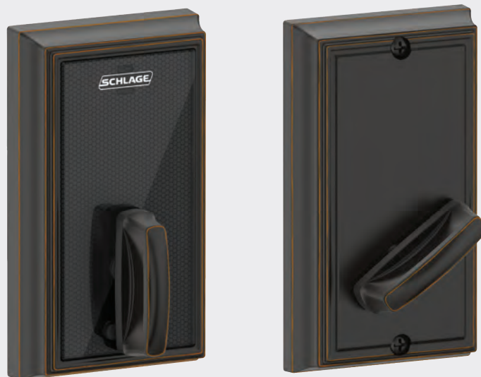
Schlage Control™ Smart Deadbolt with Addison trim in Aged Bronze